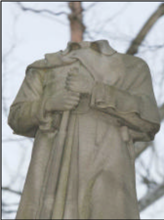
Photo depicting the vandalism of the Bridgeton Civil War monument .

In early December, a monument dedicated to those soldiers and sailors killed in the Civil War was discovered headless in the Bridgeton City Park. In addition, markings were found on the pedestal which is believed to be the work of vandalism. The cost of restoration is estimated between $10,000-$75,000.